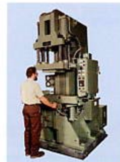
Custom C-Frame transfer molding press with shuttle table. Custom presses are available through your WABASH MPI representative.

discuss all of your molding requirements. We also manufacture 15 to 150 ton C-Frame and 4-post injection molding machines, 180 to 450 ton injection molding machines for elastomers, Compression molding machines, Transfer molding machines, Vacuum chamber molding and laminating presses and Die-cut and Trim presses. For more information on any of our equipment see your WABASH MPI representative or contact our office.