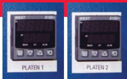
Platen Temperature Controllers

Standard 1/16th DIN platen temperature controllers.